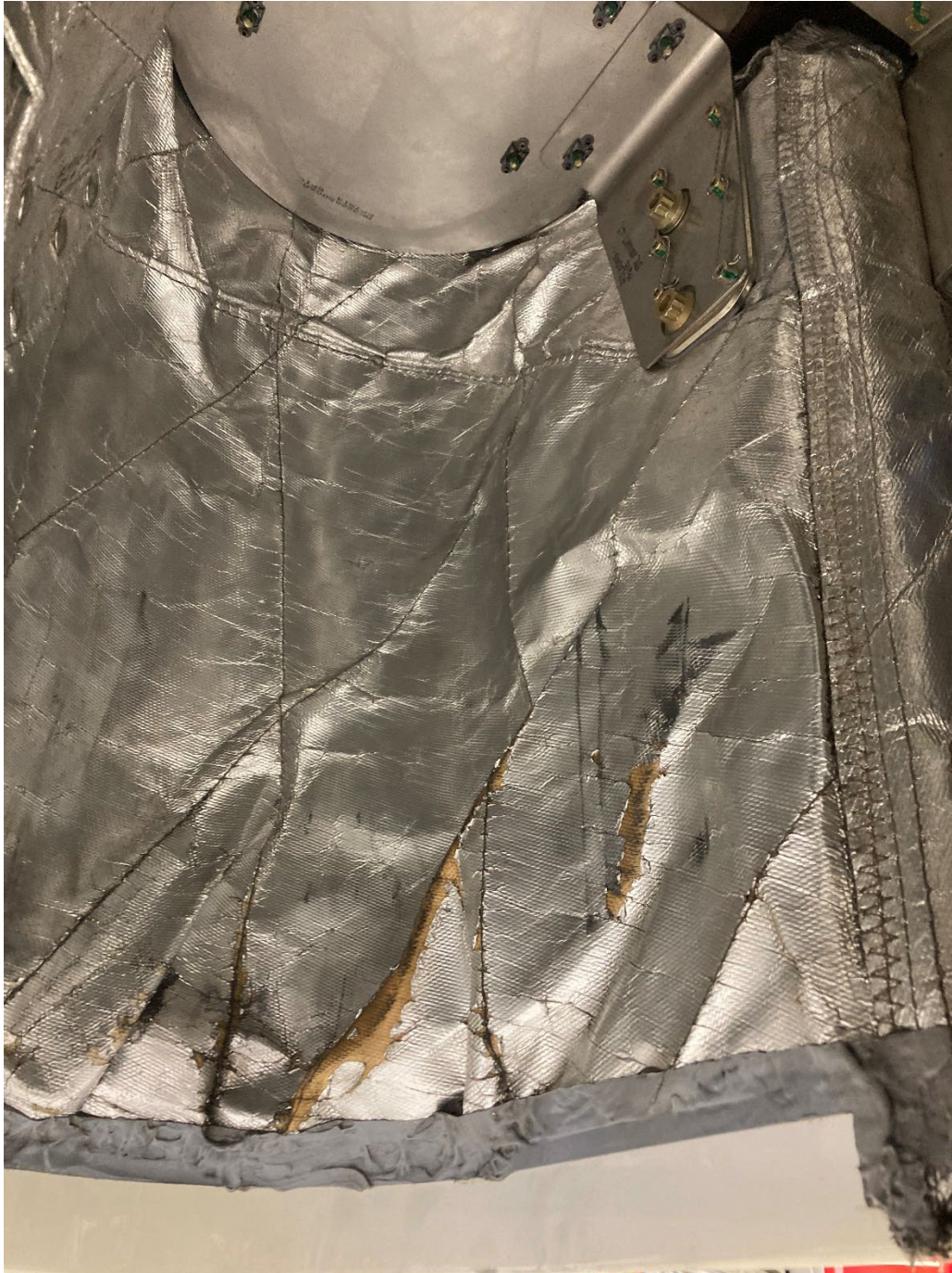
Figure 2: Firewall Blanket Inspection – View Left Side