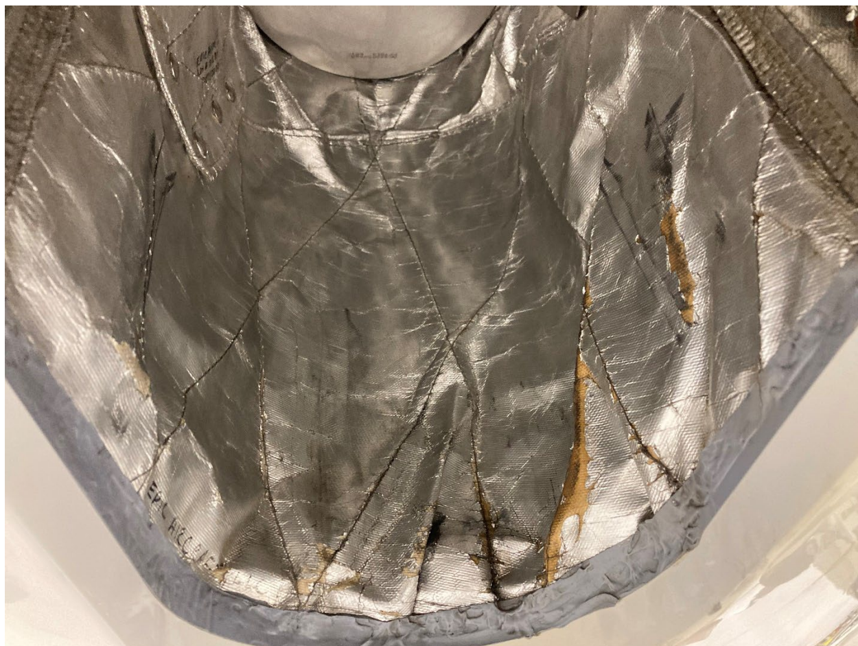
Figure 3: Firewall Blanket Inspection – View Aft