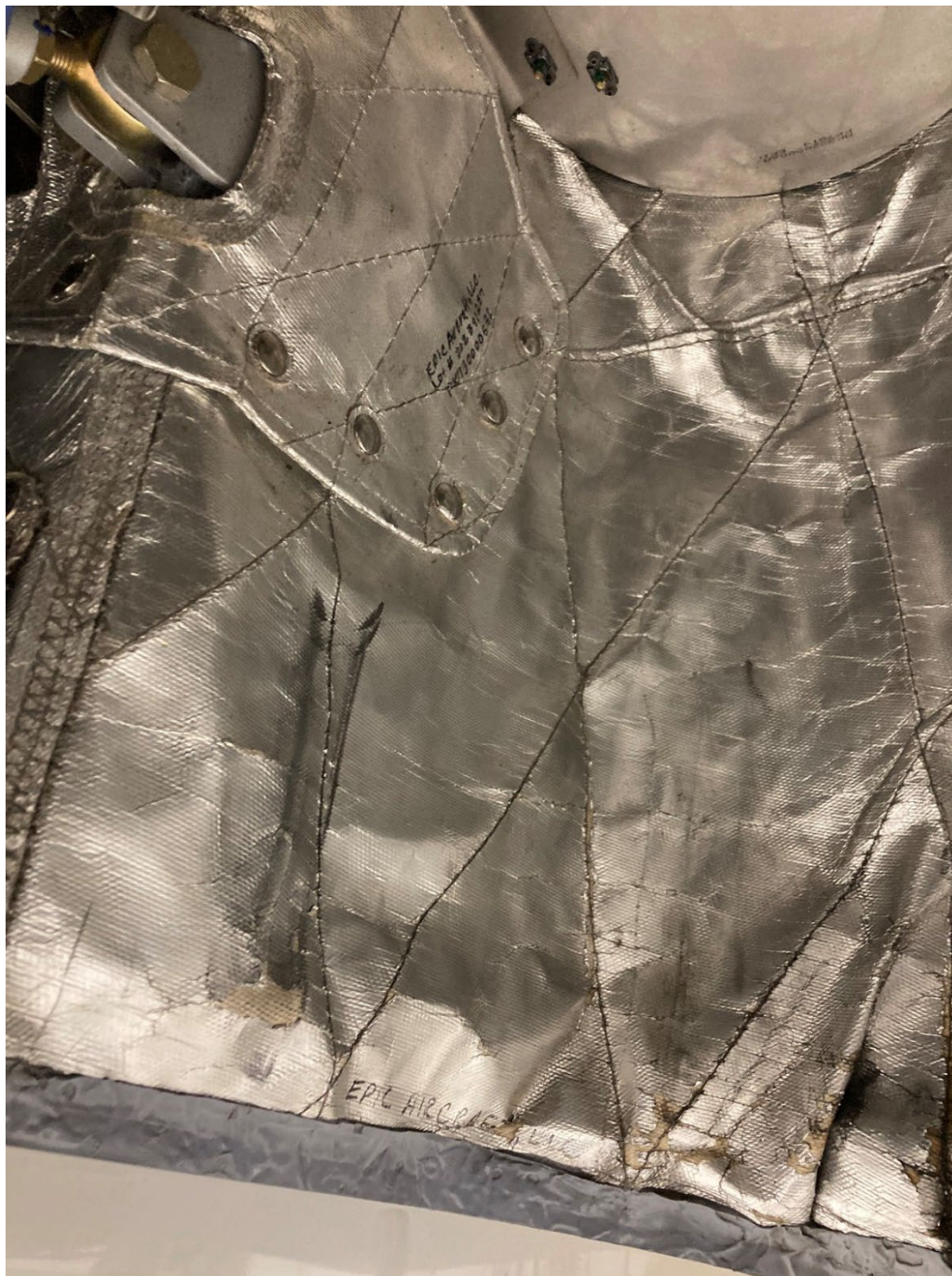
Figure 4: Firewall Blanket Inspection – View Right Side