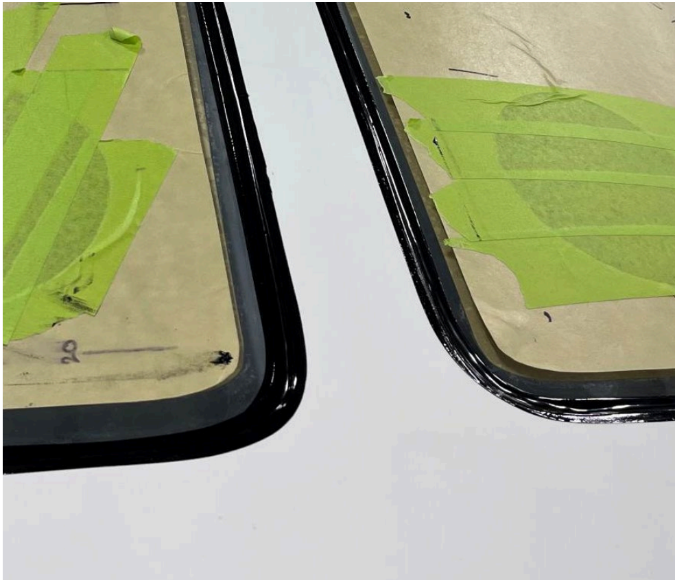
FIGURE 2: EDGE SEAL FINISH

Epic Aircraft, LLC ♦ 22590 Nelson Road ♦ Bend OR 97701 Phone: 541-318-8849 ♦ Fax: 541-382-5125 ♦ Web: www.epicaircraft.com